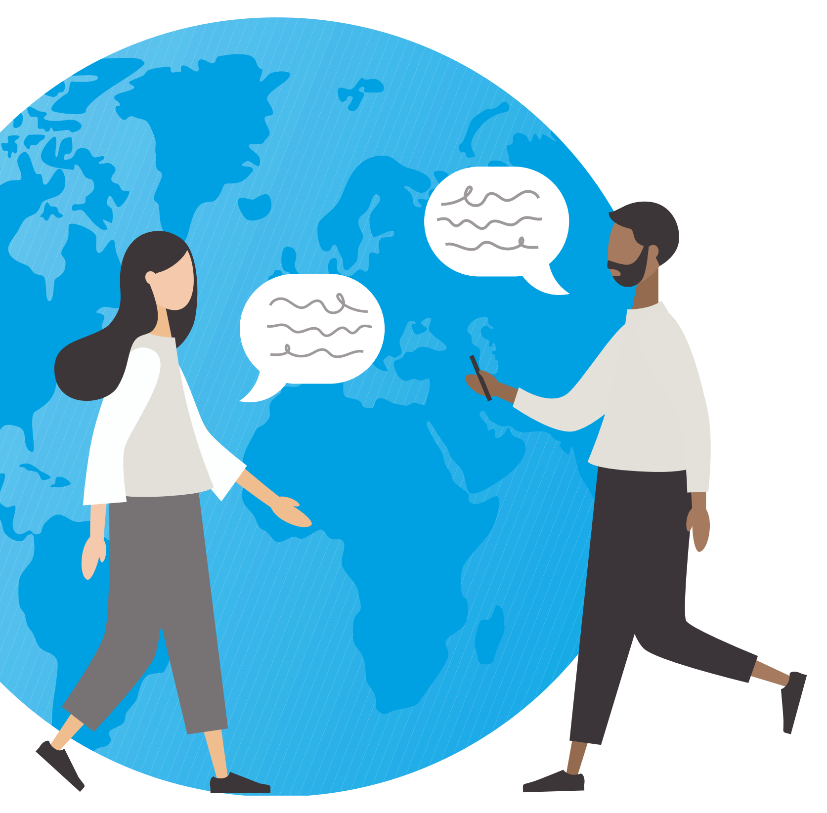
Top Considerations for Highly Effective B2B Global Marketing

Another practice that will help is moving from being reactive to proactive as it relates to obtaining feedback. Too often, marketing teams are insulated from customer interactions, which can lead to ineffectual approaches conceived in a vacuum. Vincent commented, "Your marketing team needs to be active globally. Connect with global customers through your sales team and learn what works for them and what attracts them to brands. Build relationships with distributor leaders to find out what will help them. These customer-facing resources are full of useful insights that will make your marketing better."